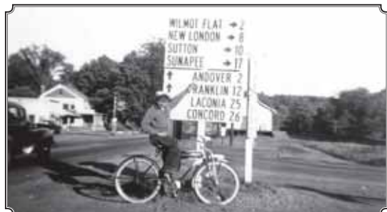
"You can get anywhere from Potter Place!"

$12 each to benefit the Andover Historical Society