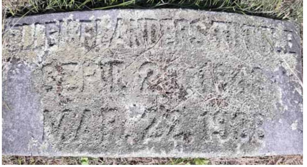
The headstone of Ellen Flanders Tuttle is shown here covered with moss and lichen at Lake View Cemetery. Caption and photo: Donna Baker-Hartwell