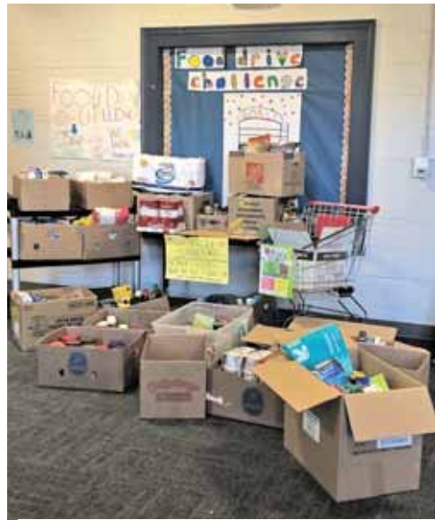
Collecting items for the local food pantry is just one of the activities that students in the AE/MS Kindness Club are involved in each year.