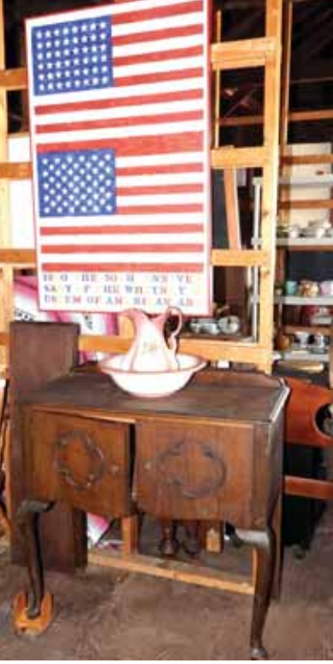
Sideboard and flag painting