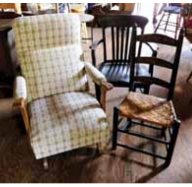
Chairs (and many more)

Open Saturdays 10 A.M. -2 P.M. Depot Street, Potter Place