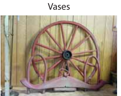
Yoke and Wheel