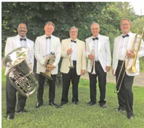
The Beacon Brass Quintet plays on Thursday, July 21, at the New London First Baptist Church.

Tickets for adults are still only $25 and for students are $5 and are available online at SummerMusicAssociates.org ; at the door the evening of the concert; or by calling 603 526-8234. Tickets may also be purchased by check or cash at Tatewell Gallery or Morgan Hill Bookstore in New London.