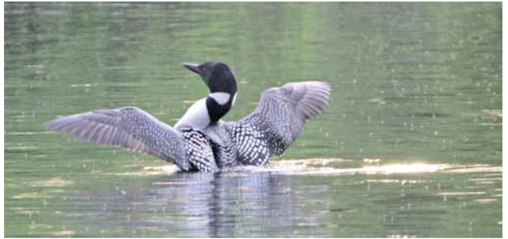
East Andover resident Ally Resch took many impressive photos of the loons on Highland Lake during the Memorial Day weekend. This one captured a loon flapping its wings, creating quite the spectacle.