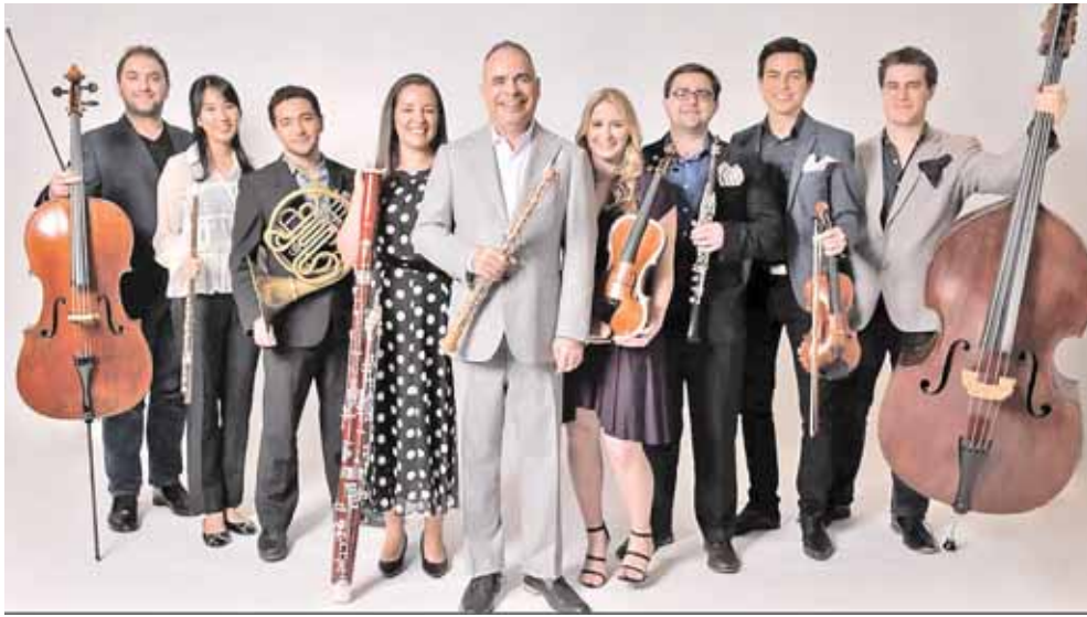
Frisson Ensemble from New York City plays on Thursday, July 7, at the New London First Baptist Church.